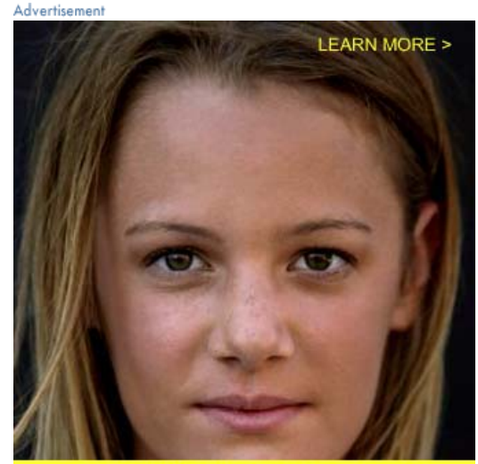
FACT: TODAY, DRUG USE IS NEARLY AS COMMON AMONG GIRLS AS IT IS BOYS.

"We thought, 'Hey, maybe this is a radio program,' " Nash says from